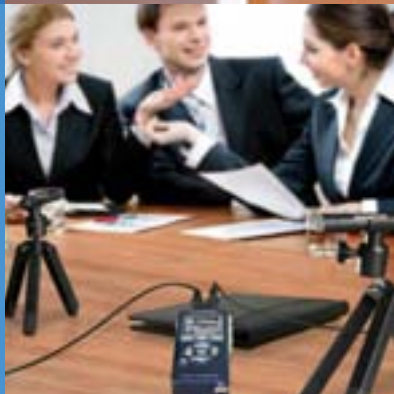
ME-30W Conference Kit

The AS-2400 transcription Kit creates the perfect combination to keep your business running smoothly.