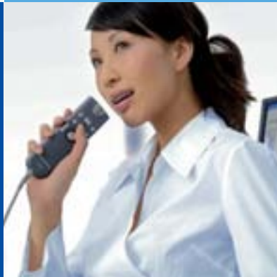
DR-1000 Dictation Kit