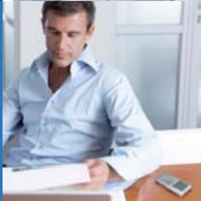
DS-2400 / AS-2400

The outstanding ergonomic design incorporates high quality microphone and speaker technology for a comfortable and crystal clear recording directly to the computer.