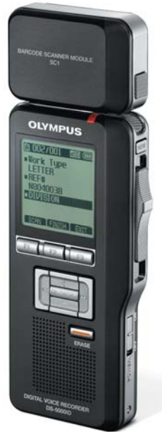
(Above: DS-5000iD with attached SC1 Barcode Scanner Module)

This optional accessory for the DS-5000 / DS-5000iD offers added security for your dictation workflow. When you start recording, simply scan the barcode of the appropriate case file and your dictation will automatically be uploaded to the correct case record on your IT system.