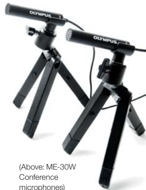
(Above: ME-30W Conference Kit microphones)

Record clear and precise audio in large spaces. When used with Olympus high-end stereo recorders, it provides 360° audio recording via left and right channel low-noise stereo microphones. You'll capture every detail and never miss a valuable contribution again.